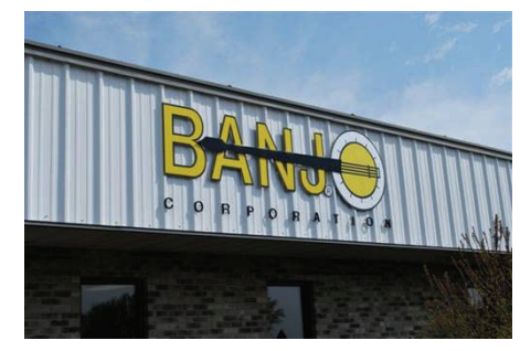
Banjo Corporation Headquarters

Flexible IBC Product Group. The Flexible IBC Product group had its inaugural meeting at the 2011 Technical Conference. RIPA staff reported that a survey had gone out to all members seeking data on the extent to which members reconditioned and/or distributed FIBCs; only one respondent indicated any significant reconditioning activity. This member reported that over 5000 FIBCs were reconditioned in the past year, and that 40 % of all incoming units are diverted for recycling or disposal. This reconditioner also noted that the typical size for an FIBC is 275 gallons or 2000 lbs. Finally, the respondent indicated that reconditioning did not currently include any washing.